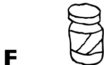
Peanut butter (2 tablespoons)