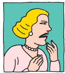
Upset or nervous