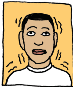
Shaky or dizzy